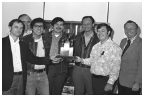
Fermilab's 1976 Golf Tournament Champions (Click on image for larger version.)

Remove - Use sticky tape for unattached ticks. Embedded ticks should be removed ASAP since the infection risk increases with duration of attachment. Karen Swanson of the Medical Department recommends the use of tweezers. Grasp firmly as close to the skin as possible and gently but firmly pull the tick straight out. Make sure you get all the mouthparts. Wash with soap and water. If you want help, the Medical Department is available to assist.