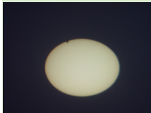
The transit of Venus as seen in Batavia yesterday at 6:10 a.m. (Click on image for larger version.)