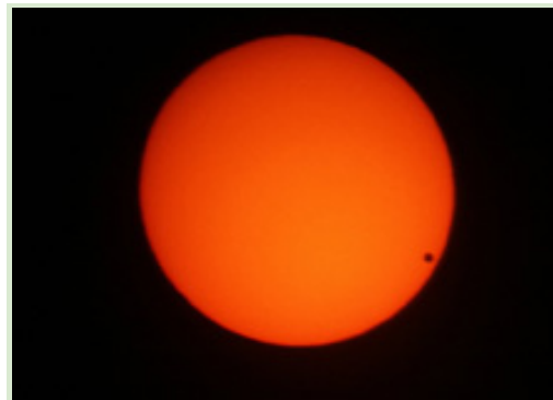
The transit of Venus as seen from Wilson Hall yesterday at sunrise. (Click on image for larger version.)