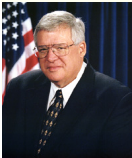
Dennis Hastert is Speaker of the House.

Wednesday, November 1, 8:40 a.m. Ramsey Auditorium. All are welcome.